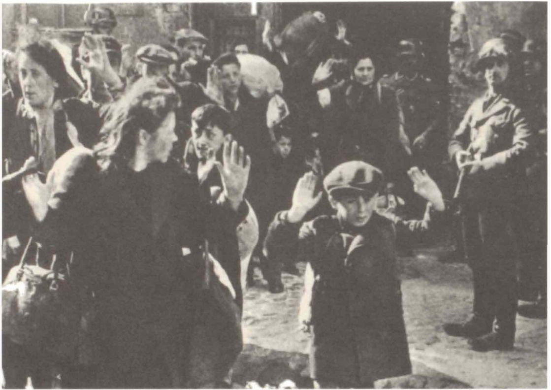
A classic photograph of the Holocaust, showing the moment when the Jews photographed here were taken out of their hiding place in a bunker in Warsaw, Poland.